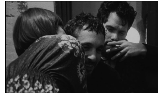
FRIENDS by Mar Coll 2011 / 7 min Film & Visual Arts School of Catalonia (ESCAC), Barcelona, Spain