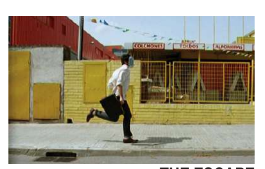
THE ESCAPE by Victor Carrey 2010 / 11 min Film & Visual Arts School of Catalonia (ESCAC), Barcelona, Spain