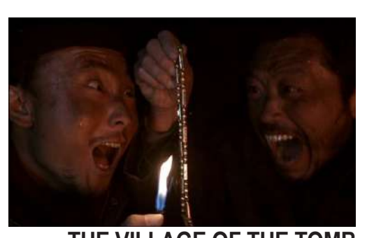
THE VILLAGE OF THE TOMB by Jue Li 2010 / 28 min Beijing Film Academy, China