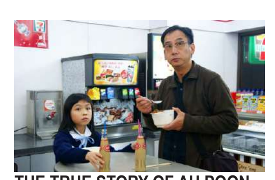
THE TRUE STORY OF AH POON by Tsim Ho Tat 2010 / 30 min Hong Kong Academy of Performing Arts, Hong Kong