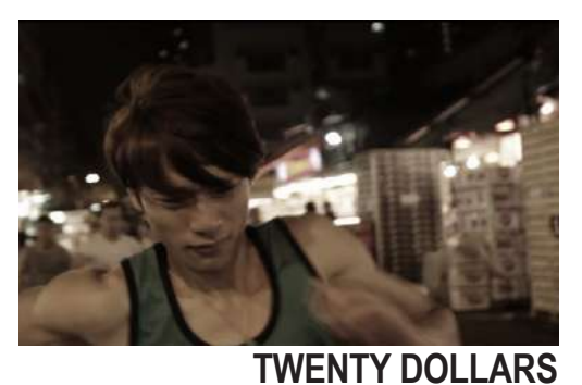
by Lam See Chit 2011 / 15 min Film Academy of Hong Kong Baptist University, Hong Kong