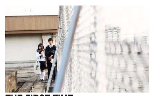
THE FIRST TIME by Emmanuel Osei-Kuffour 2010 / 14 min NYU at Singapore, Singapore