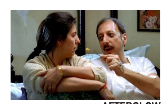
AFTERGLOW by Kaushal Oza 2011 / 19 min Film and Television Institute of India, Pune, India