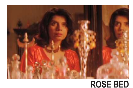
by Aarambhh M Singh 2011 / 10 min Whistling Woods International, Mumbai, India