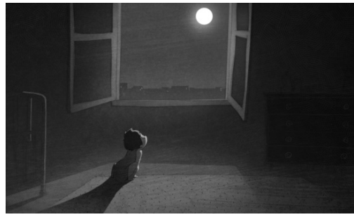
HOWL by Nathalie Bettelheim 2011 / 7 min Bezalel Academy of Arts and Design of Jerusalem, Israel