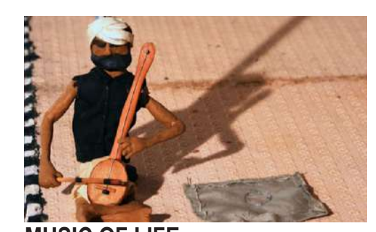
MUSIC OF LIFE by various 2012 / 4 min Whistling Woods International, Mumbai, India & Bradford College, UK