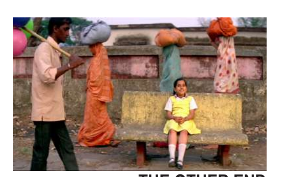
THE OTHER END by Arati Kadav 2011 / 17 min Whistling Woods International, Mumbai, India