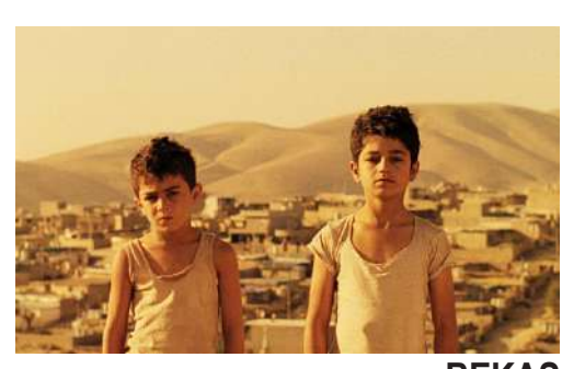
BEKAS by Karzan Kader 2010 / 29 min Stockholm Academy of Dramatic Arts, Sweden