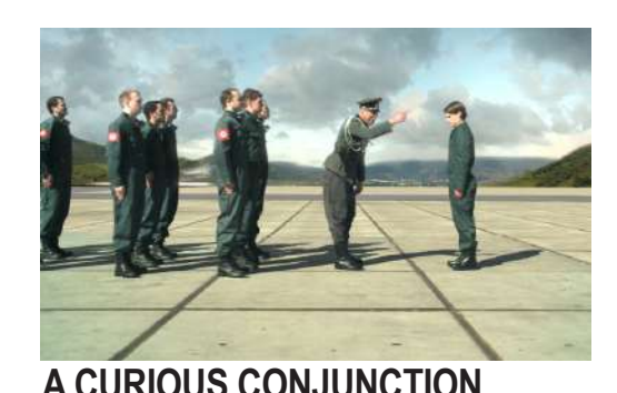
A CURIOUS CONJUNCTION OF COINCIDENCES by Joost Reijmers 2011 / 9 min Nederlands Film and Television Academy, Holland