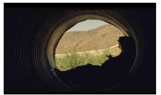
AZAD by Bandar Albuliwi 2010 / 20 min American Film Institute, Los Angeles, US