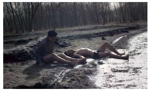
THE OUTSIDER by Kang Liang 2011 / 24 min Beijing Film Academy, China